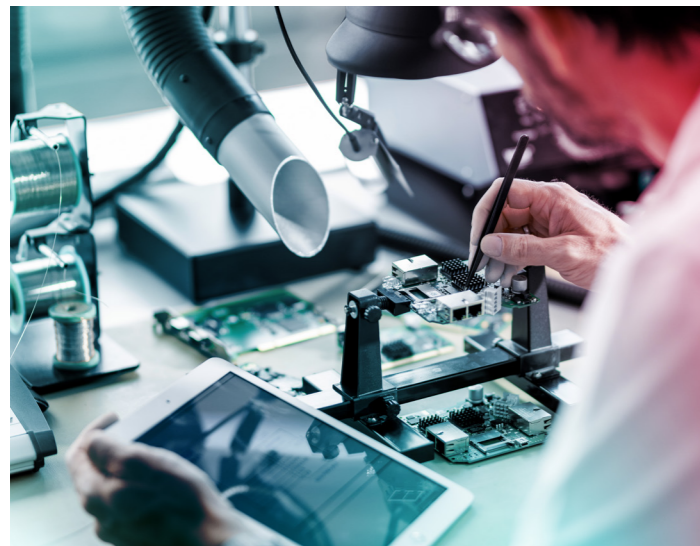
Reliability is a key requirement for the industrial service specialist

Utilizing Hilscher's proven and reliable technology, the German industrial service specialist has established the foundation to further develop ideas of its customers. These include, among other things, integrating its knowledge and know how regarding troubleshooting into digital twins of machines. In order to realize and implement such ideas, Leadec must be able to rely on safe measuring equipment and its test readings.